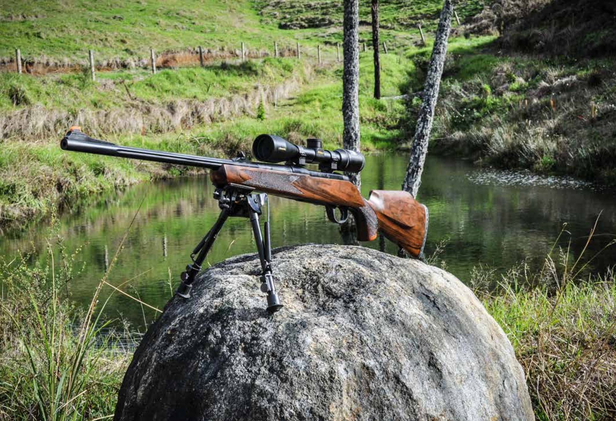
A new rifle on the New Zealand market – the Zoli features European styling and craftsmanship.